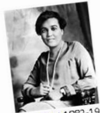
Jessie Fauset 1882-1961 Editor, Journalist, Author, Poet