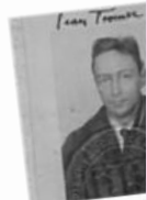
Jean Toomer 1894-1962 Author, Playwright