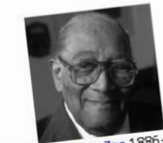
James Van Der Zee 1886-1983 Photographer

Students research a famous figure from the Harlem Renaissance and create a PPT or Google Slides presentation