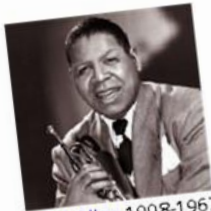
Henry Allen 1908-1967 Trumpet Player