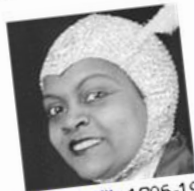
Florence Mills 1896-1932 Dancer, Singer