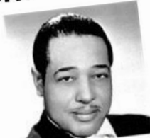
Duke Ellington 1899-1974 Songwriter, Conductor, Pianist