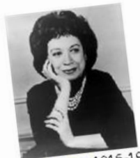
Alice Childress 1916-1994 Author, Playwright