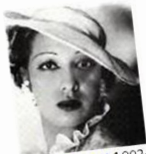
Gwendolyn Bennett 1902-1981 Artist, Editor, Author, Poet