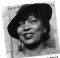
Zora Neale Hurston 1891-1960 Author