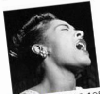
Billie Holiday 1915-1959 Singer