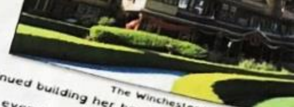
The Winchester House

...to ... years, when Sarah ... feet. The real ... knew why Sarah continued building her home.