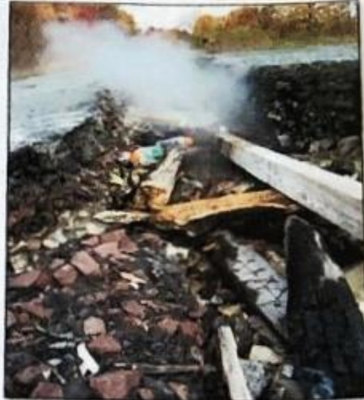
Centralia's Graffiti Highway

Today, only a few residents remain, and adventure-seeking tourists stop in to take photos of the smoke that is still rising from the ground and the split, graffiti-covered highway.