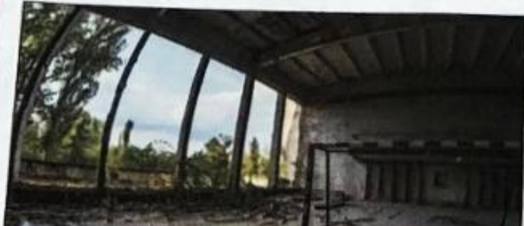
Empty Classroom, Pripyat