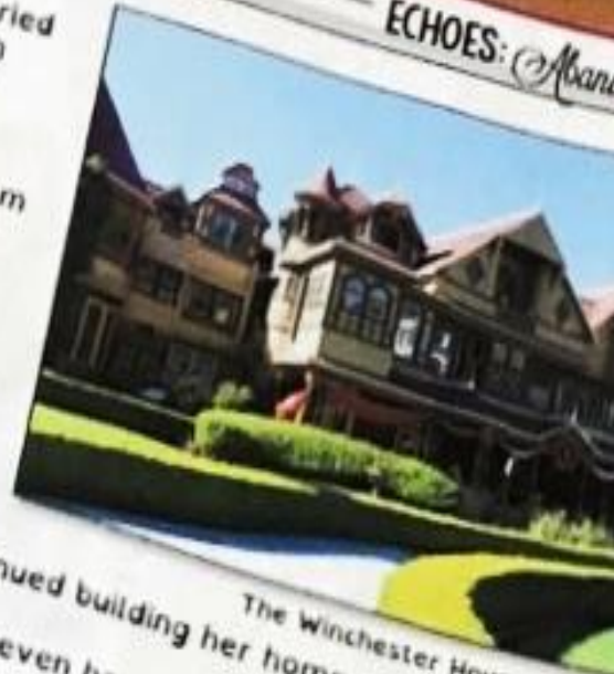
The Winchester House